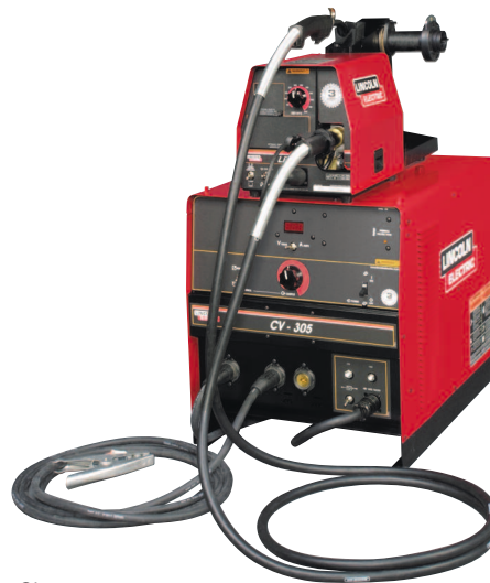
Shown: CV-305 / LF-72 Wire Feeder Ready-Pak® Package

(Order Swivel Kit K2332-1 for even more flexibility! Note: Can't be used at the same time with undercarriage while gas cylinder(s) are installed.)